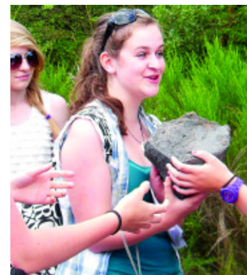
BARCELONA LAVA BOMB

As well as investigating this amazing volcanic landscape at Garrotxa Natural Park, the students undertook street surveys in Barcelona collecting data to analyse back at School to see whether the area had been affected by the regeneration of the port.