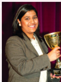
KINNERY PATEL WILDE AWARD FOR BUSINESS EDUCATION