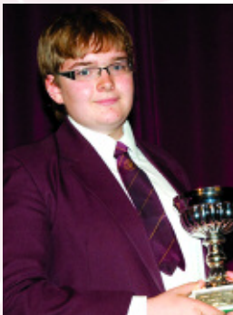
MATTHEW TURNER ACHIEVEMENT AWARD FOR MUSIC