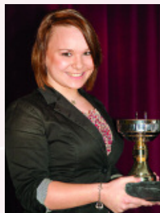
KERRY LANCASTER HEALTH AND SOCIAL CARE AWARD