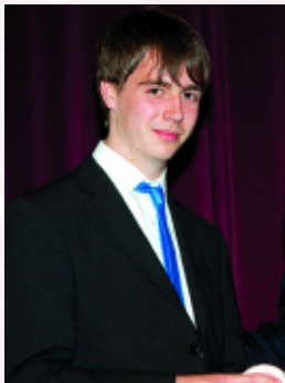
ALEXANDER SCOTT STEPHEN MURRAY AWARD FOR INTERNATIONAL UNDERSTANDING