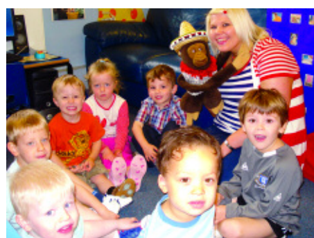
SPANISH NURSERY SCHOOL