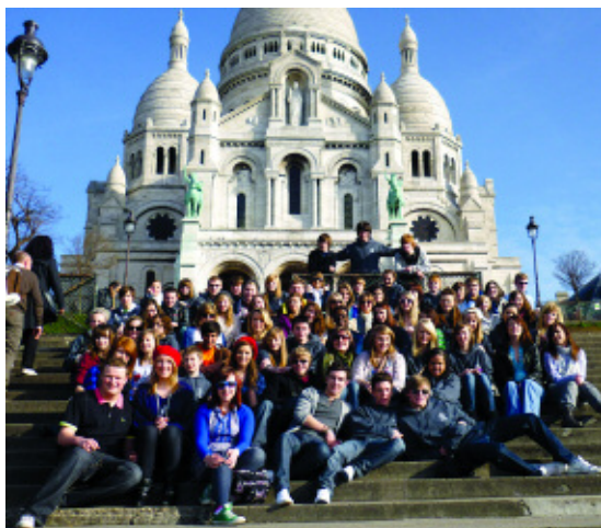
SIGHTSEEING IN MONTMARTRE. THE GROUP TAKE A BREATH BY THE SACRE COUER CHURCH HAVING CLIMBED THE 300 STEPS TO THE TOP OF THE HILL.