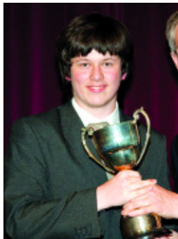
DAVID CONNOLLY WAKEFORD AWARD FOR MATHEMATICS