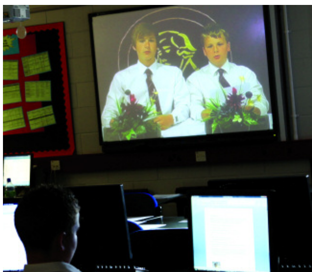
PRESENTING THE NEWS ON THE LIVE TV BROADCAST