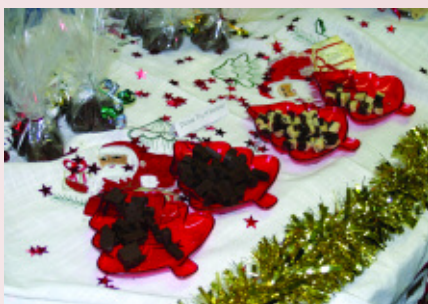
SOME OF THE COLOURFUL ITEMS PRODUCED FOR SALE BY THE STUDENTS