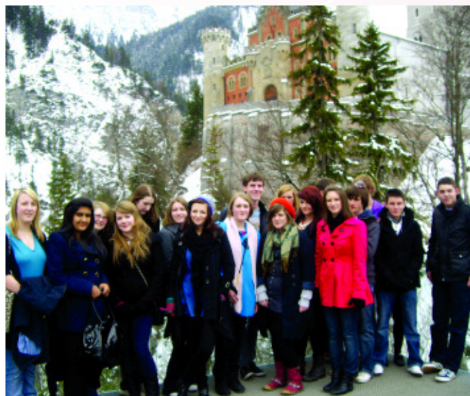
STUDENTS OUTSIDE THE NEUSCHWANSTEIN CASTLE