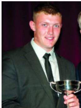
DANIEL WILLIAMS TAYLOR AWARD FOR BUSINESS