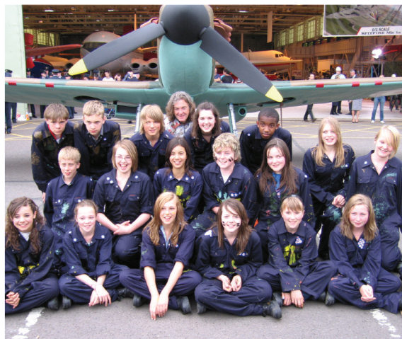
JAMES MAY WITH SOME OF THE YEAR 8 STUDENTS AT RAF COSFORD

James May was a delight to work with and he thanked the students for their help in the making of the programme."