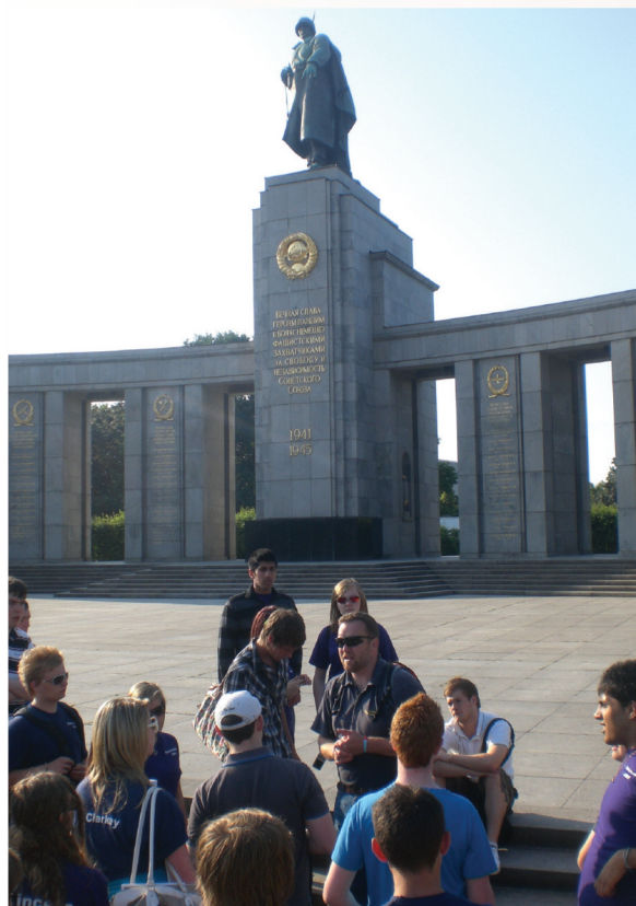
STUDENTS LEARNING ABOUT SOVIET INFLUENCE IN POST-WAR GERMANY AT THE SOVIET WAR MEMORIAL, TIERGARTEN, BERLIN

After stopping to take photos at the iconic Brandenburg Gate, we made our way towards the Reichstag building, where the German government have their parliament. This is a fantastic example of the 'old and new' coming together to make Berlin an exciting and bustling city. This was further emphasised when students visited the IMAX cinema at Potsdamer Platz, where they enjoyed a 3Dfilm entirely in German. A visit to the Olympia Stadion in Charlottenburg and a boat trip along the River Spree completed a hectic, but enjoyable week. The shining sun and wonderful temperature helped to put the smiles on all of our faces and, despite very tired legs, the students were already talking about visiting Berlin again before we landed in Birmingham!"