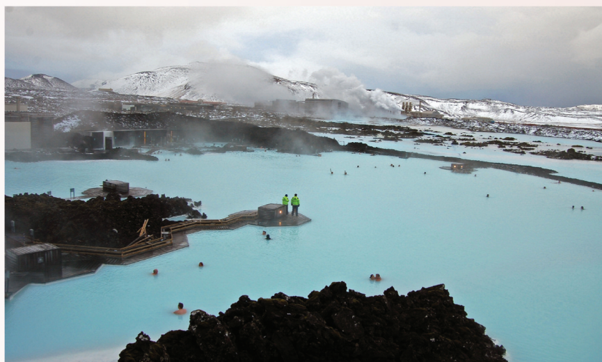
A DIP IN THE BLUE LAGOON HOT SPRING

A short ride in five and nine seater planes