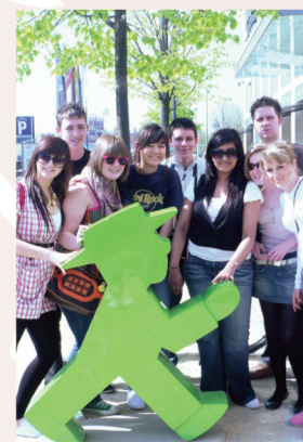
A LEVEL GERMAN STUDENTS POSING WITH THE FAMOUS 'AMPELMANN' OF BERLIN

Sixth Form German students immersed themselves in the language as they experienced the culture and history of Berlin's attractions connected with their A Level syllabus.