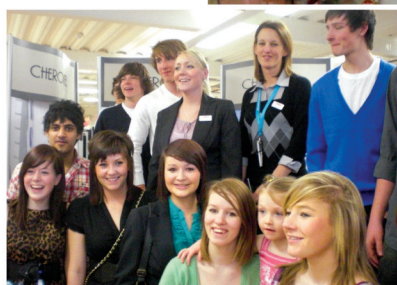
SOME OF THE BTEC BUSINESS STUDENTS WITH REPRESENTATIVES FROM TESCO