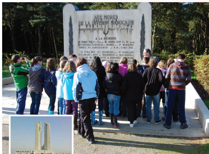
STUDENTS AT THE FRENCH MEMORIAL AT VIMY RIDGE

Around seventy Year 8 students took part in a visit to some of the World War One battlefields in France and Belgium.