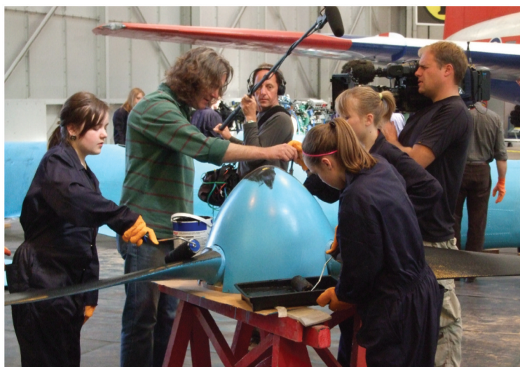
JAMES MAY WORKING ON THE SPITFIRE AT RAF COSFORD WITH YEAR 8 STUDENTS