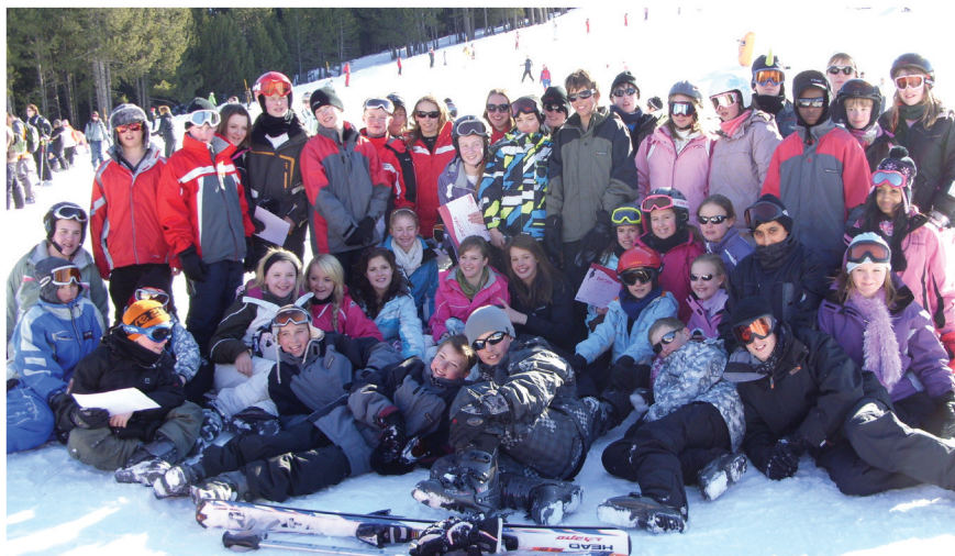
ANOTHER GREAT DAY ON THE SLOPES

Superb weather and excellent skiing conditions were enjoyed by students and staff alike, with six hours skiing each day followed by various evening activities including bowling, ice skating and the local natural spa. A magnificent time was had by all and plans are already afoot for the next trip in 2011.