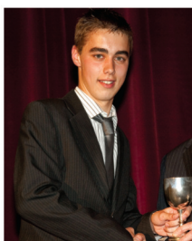
CRAIG ABLEY BARNES AWARD FOR HOSPITALITY AND CATERING