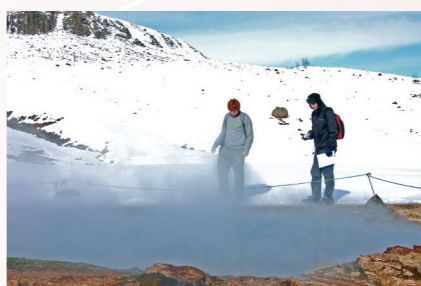
WAITING FOR THE GEYSER TO ERUPT

took us to the volcanic island of Heimaey where we climbed the volcano and studied the impact of its eruption on the town. An experience definitely not for the faint hearted! Finally, no trip is complete without a visit to the country's capital, Reykjavik for a little retail therapy."