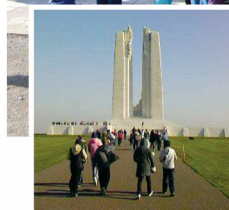
STUDENTS APPROACH THE CANADIAN MEMORIAL AT VIMY RIDGE

The tour, designed to help the students more fully understand the Great War included the Menin Gate at Ypres, the site of the first gas attack in warfare as well as the Tyne Cot Cemetery and the Thiepval Memorial to 72,000 men who have no known grave. Some of the students were able to locate the graves of relatives who had perished on the Western Front and students took part in the Menin Gate Ceremony which has been held every night since the end of the war.