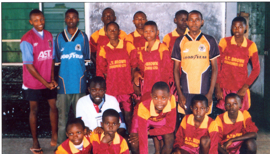
Boys from the Orphanage in Milindi proudly wearing their football shirts