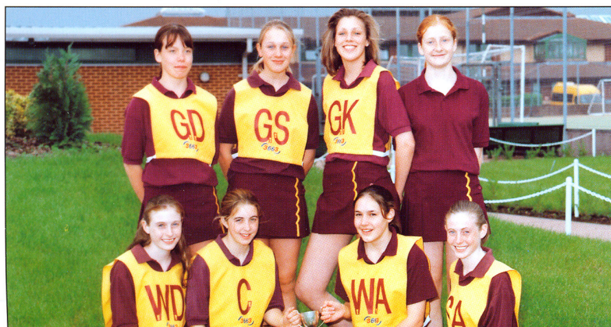
Year 9 County Champions