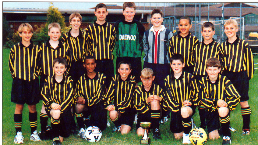
Under 12 Boys CTC Champions