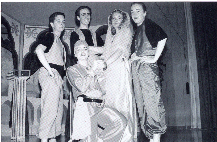
Students from the cast pose for the camera