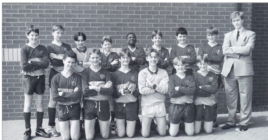
The Year 8 CTC Knockout Cup winners

The School's All Weather Floodlit Pitch is currently progressing well. The team of contractors, having been graced with a spell of good weather recently are currently two weeks ahead of schedule. Now that the top surface has been laid the next stage is for the dried silica sand to be placed on and brushed into the pitch. The construction manager said "the pitch will hold approximately 220 tons of sand on the playing surface when completed". By the next edition of the newsletter the pitch will be operational and the students will be taking full advantage of this exciting new facility.