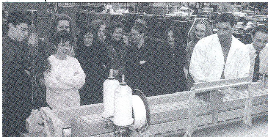
Thomas Telford students pictured during their recent visit to Bolton.

Institute and covers most aspects of textile design work including weaving and printing and it will hopefully make the students aware of the range of options and types of qualifications open to them. As part of the Institute's hospitality the students were taken to the Hollywood Bowl, an American style bowling alley, and to the region's best known provincial theatre, the Octagon, to see Arthur Miller's, 'Death of a Salesman'.