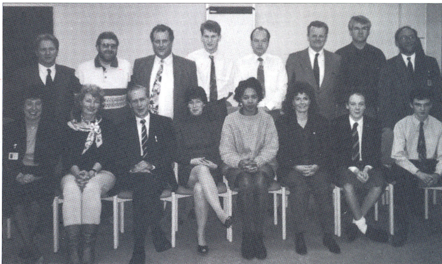
Advisory Council Members: