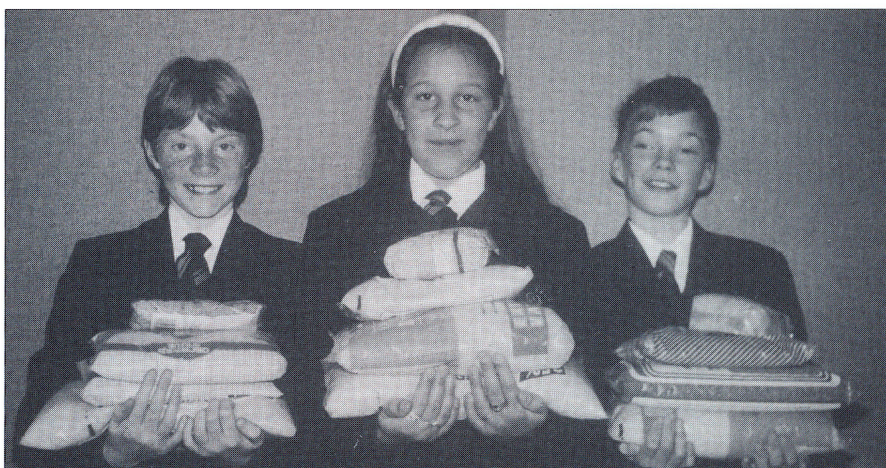
Year 7 students weigh Somalia rice