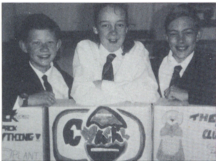
Year 8 Students display their designs.

FIFTY Year 8 students had their maths work professionally judged this term by a team of experts from local company, Telford Packaging.