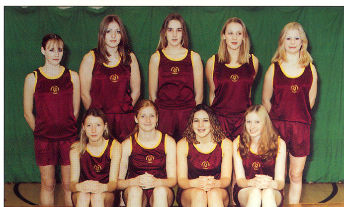
Intermediate Girls Regional Champions