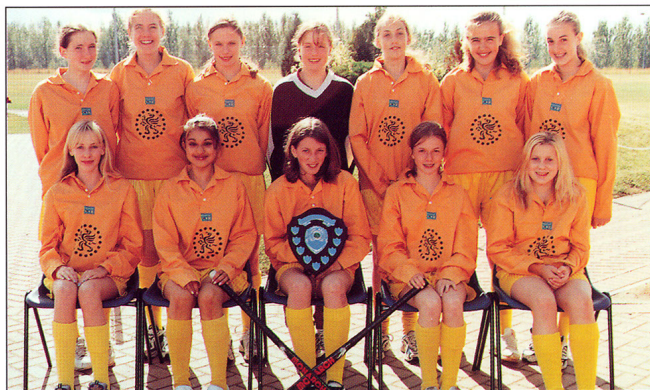
Under 14 County Champions.