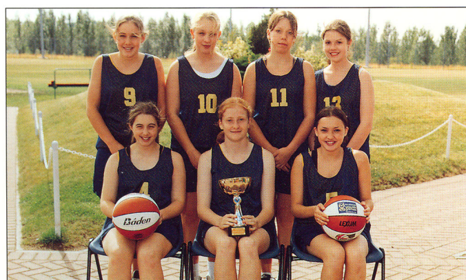
Under 15 County Champions