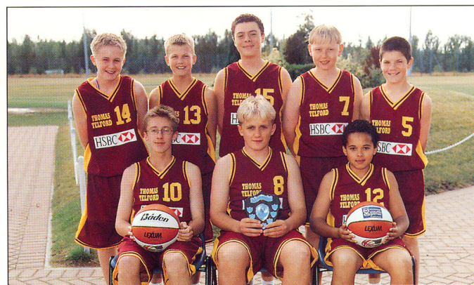
Under 13 County Champions