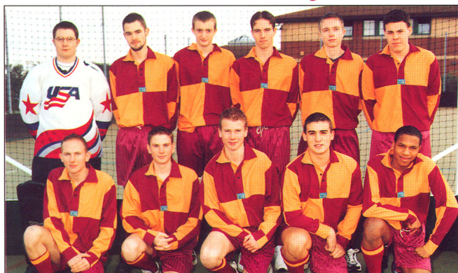
Under 16 County Champions