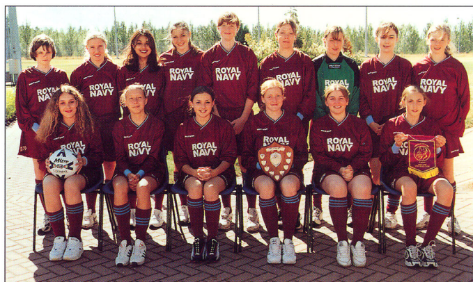
Under 15 County Champions.