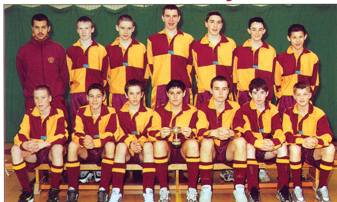
Under 14 County Champions