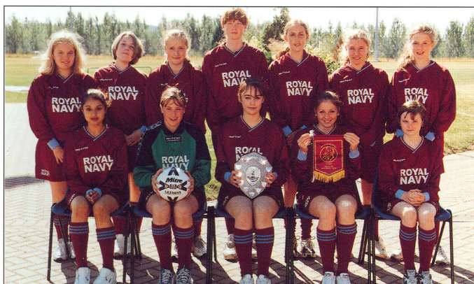
Under 14 CTC/Sports Colleges Champions