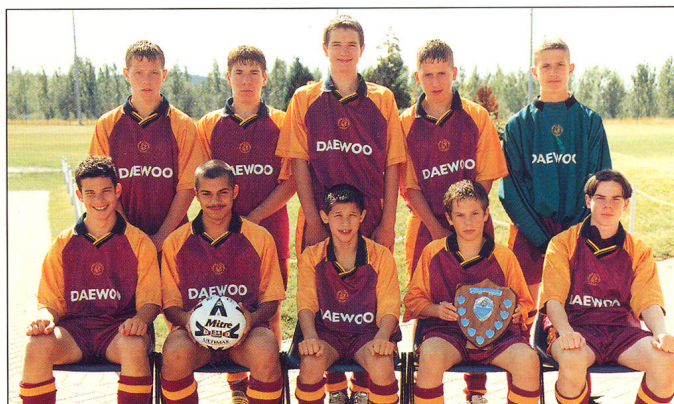
Under 14 7-a-side County Champions