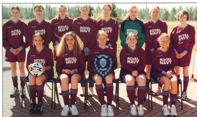
Under 16 Floodlit League Champions