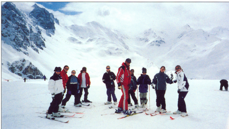
Some members of the ski party with their instructor at the top of the Olympic Blue & Red Runs