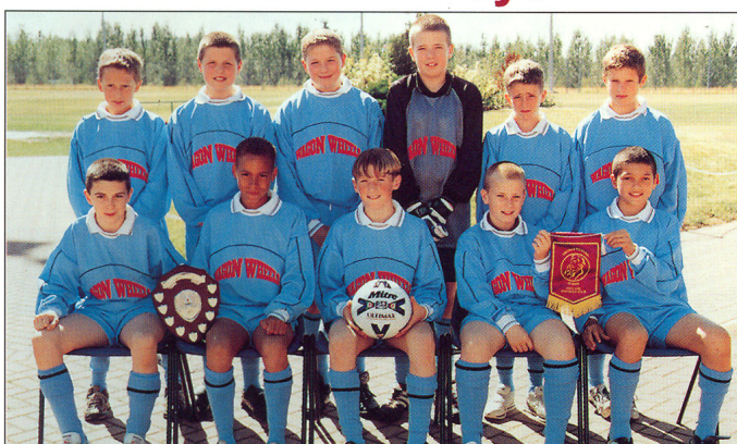
CTC/Sports Colleges and Wagon Wheels 5-a-side Regional Champions