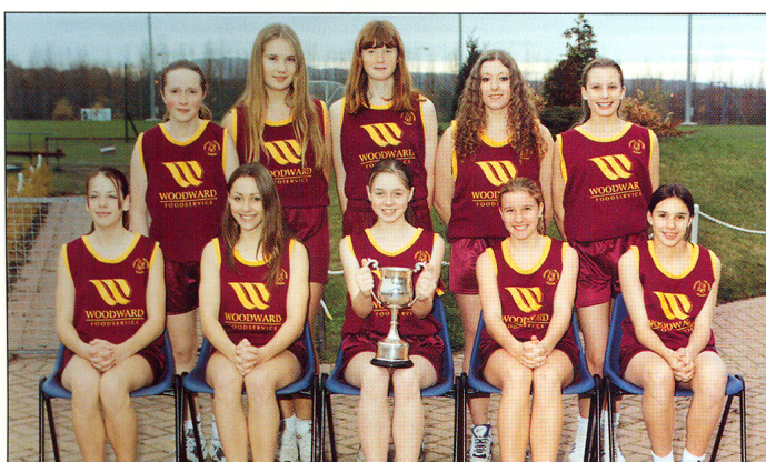
Junior Girls County Champions