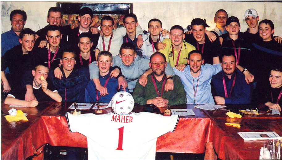
Squad members, staff and dads at the celebration dinner in an Italian Restaurant in Penrith