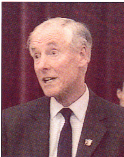
Sir Adrian Cadbury opens the School's Industry '96 Exhibition

Sir Adrian Cadbury, as President of Industry '96, opened the Exhibition on 30 April and we welcomed a party from the School's main sponsors, the Mercers'