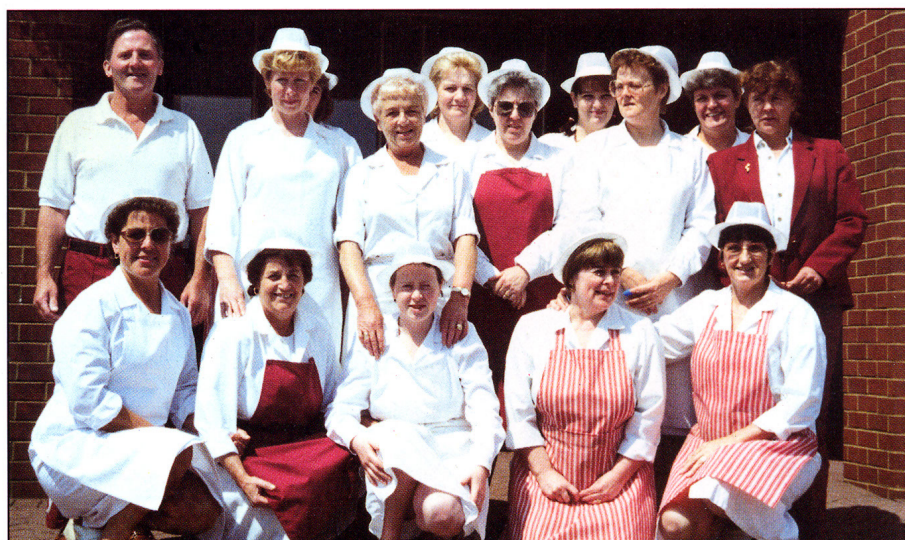
Thomas Telford School Kitchen Staff